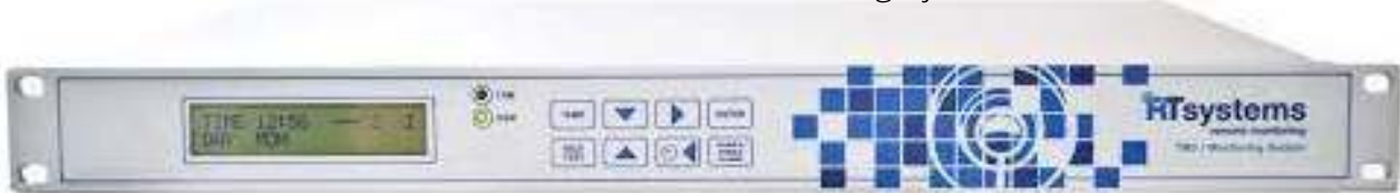
(TM3 Environmental Monitoring System)

Infrastructure is the lifeline for data center and facility. Equipment such as sensors, air conditioning systems, generators, water leak detection system, PACU, FDAS, and UPS needs to operate at their full capacity to ensure uninterrupted operation. If not properly monitored these environmental threats can cause a lot more damage than software or hardware problems.